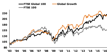
(As calculated by Overberg 31 Aug 2016)