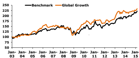
(As calculated by Overberg 28 Feb 2015)