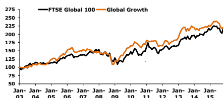
(As calculated by Overberg 30 Nov 2015)