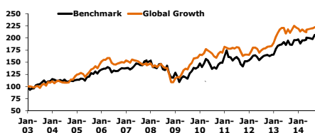
(As calculated by Overberg 30 Sep 2014)