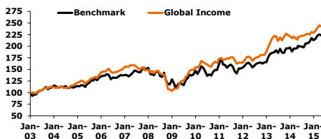
(As calculated by Overberg 30 Apr 2015)