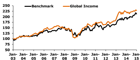
(As calculated by Overberg 31 Dec 2014)