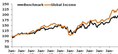
(As calculated by Overberg 30 Nov 2013)