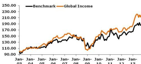
(As calculated by Overberg 30 Sep 2013)